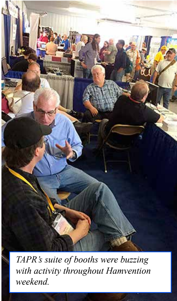
TAPR's suite of booths were buzzing with activity throughout Hamvention weekend.